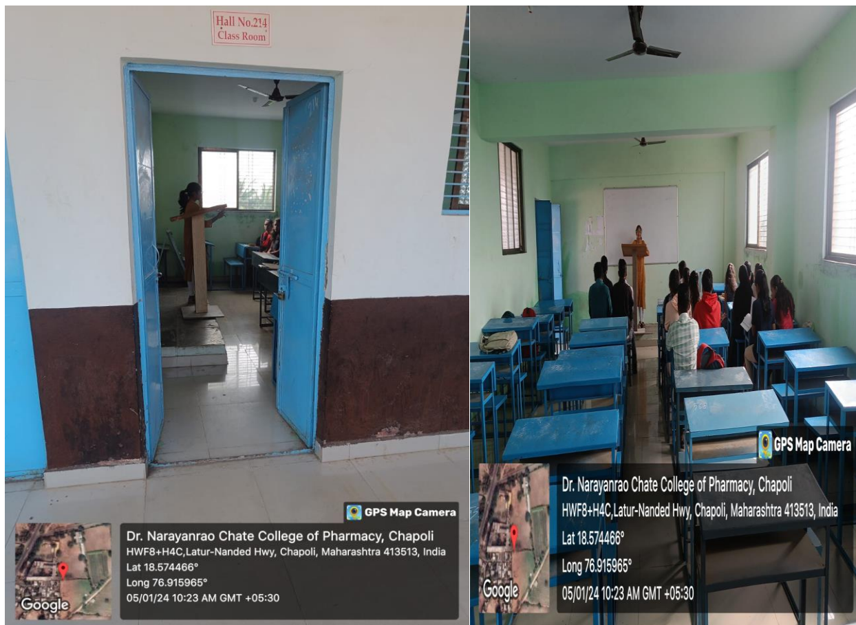
Classroom 2 External and Internal view

Mobile +918080332121 Email- dnccop@gmail.com Website- www.dnccop.org