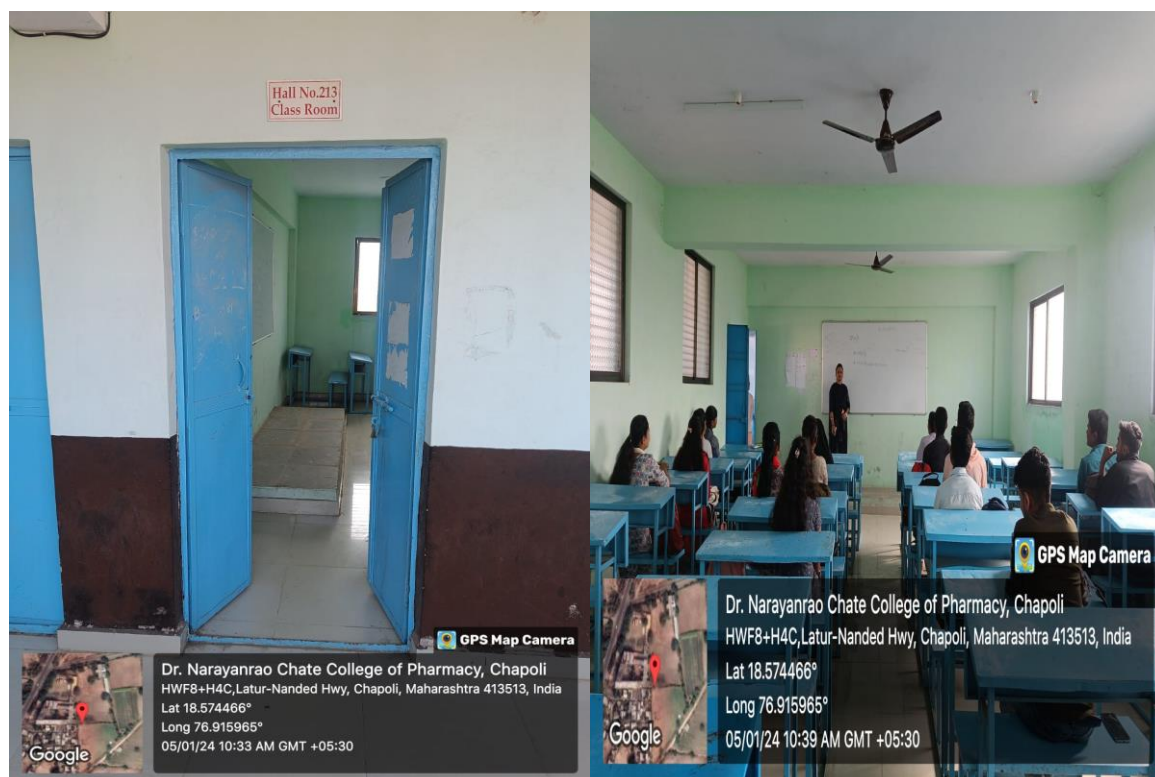
Classroom 1 External View Internal View

Classrooms are well ventilated and provided with ICT enabled facilities viz. LCD projectors, CPU, platforms, podiums and White boards, CCTV camera to conduct academics by blended teaching learning methods includes use of PowerPoint presentations., educational videos through software's like Google classroom, zoom platform, LMS by Vmedulife software.